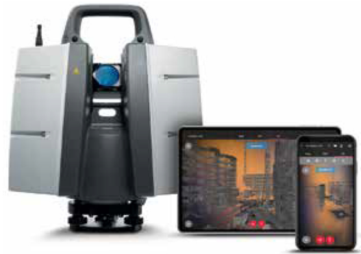
Leica ScanStation survey-grade, 3D laser scanner and Leica Cyclone FIELD 360 mobile-device app.