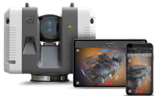
Leica RTC360 3D laser scanner and Leica Cyclone FIELD 360 mobile-device app.